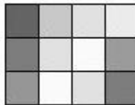
Figure 1: A grey-scale image

Now consider a two-dimensional grey scale image of size m \times n , with each pixel taking on values from 0 to 255, inclusive. For example, consider the following image of size 3 \times 4 :